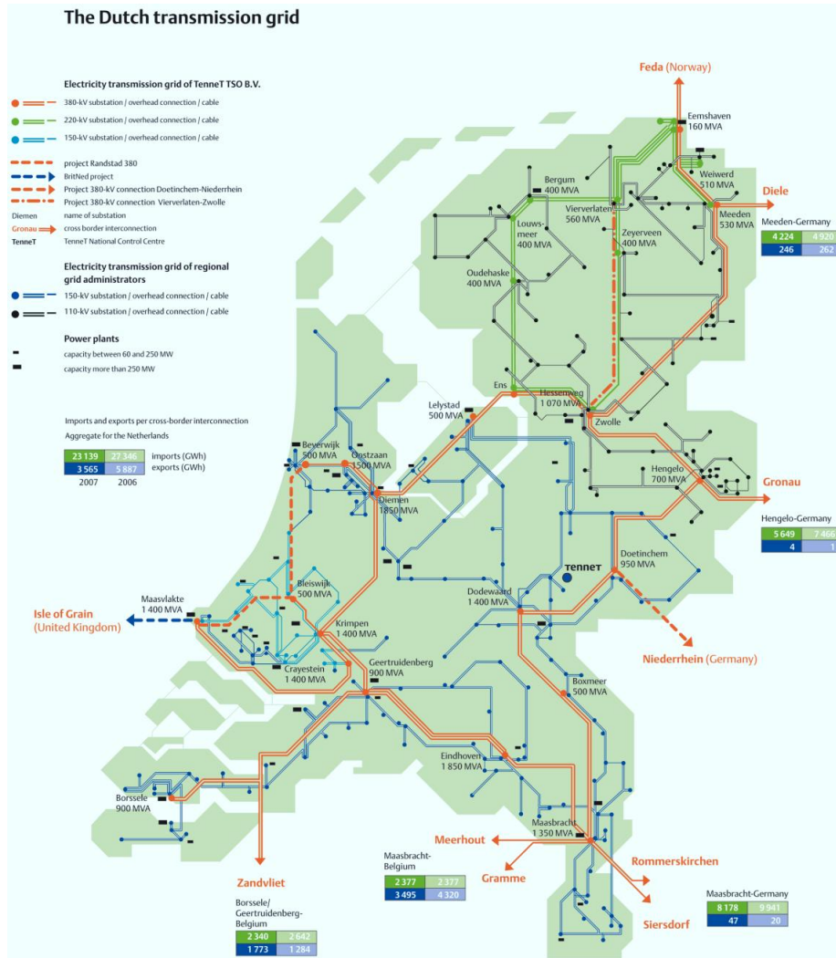
Fig. 1. The Dutch transmission grid.

Due to the wide affected range of railway traffic, it was not until 3 pm that the whole system has been restored. Around one million households were affected by the outage, one of the largest in the Netherlands in recent years. The last failure on the grid took place in 1997.