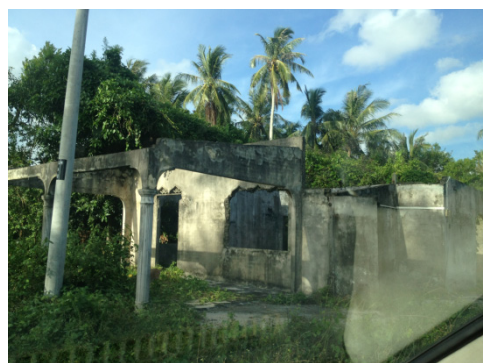
Fig. 2. A damaged house left by its owner due to the tsunami impact.

The state council has built a low cost residential area just to cater the tsunami victim which is located just 300m from the beach. The residential area is called Taman PermatangKatong. The area was formerly forested areas that were transformed into a residential area to cater the needs of the affected community of the tsunami occurrence. There are approximately 126 houses in the residential area which mostly are owned by families. The residential areas were equipped with basic facilities and utilities such as a surau, a playground and a multipurpose hall.